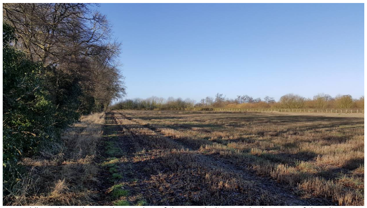
View along the northern edge of the tree belt towards the west of the site