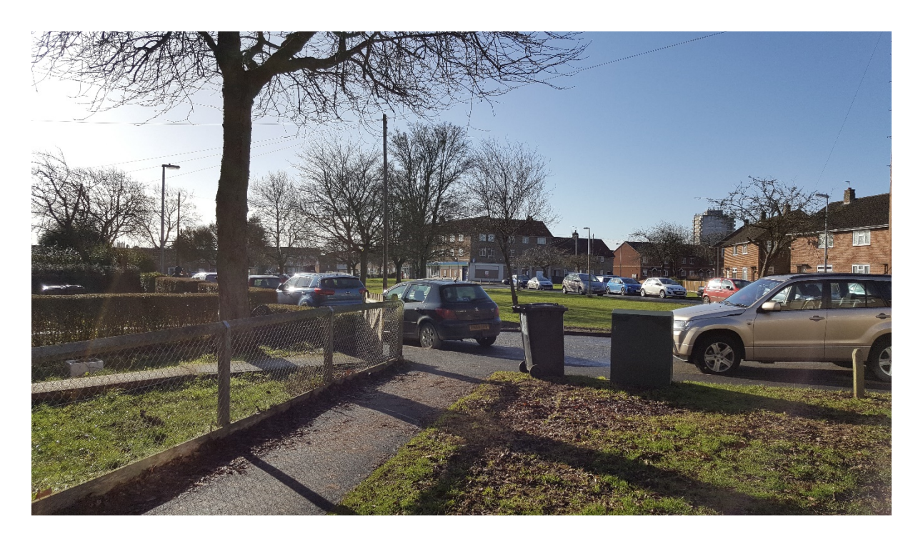
The views above and below are of Clarendon Gardens which will be used as a pedestrian/cycle access/egress for the development