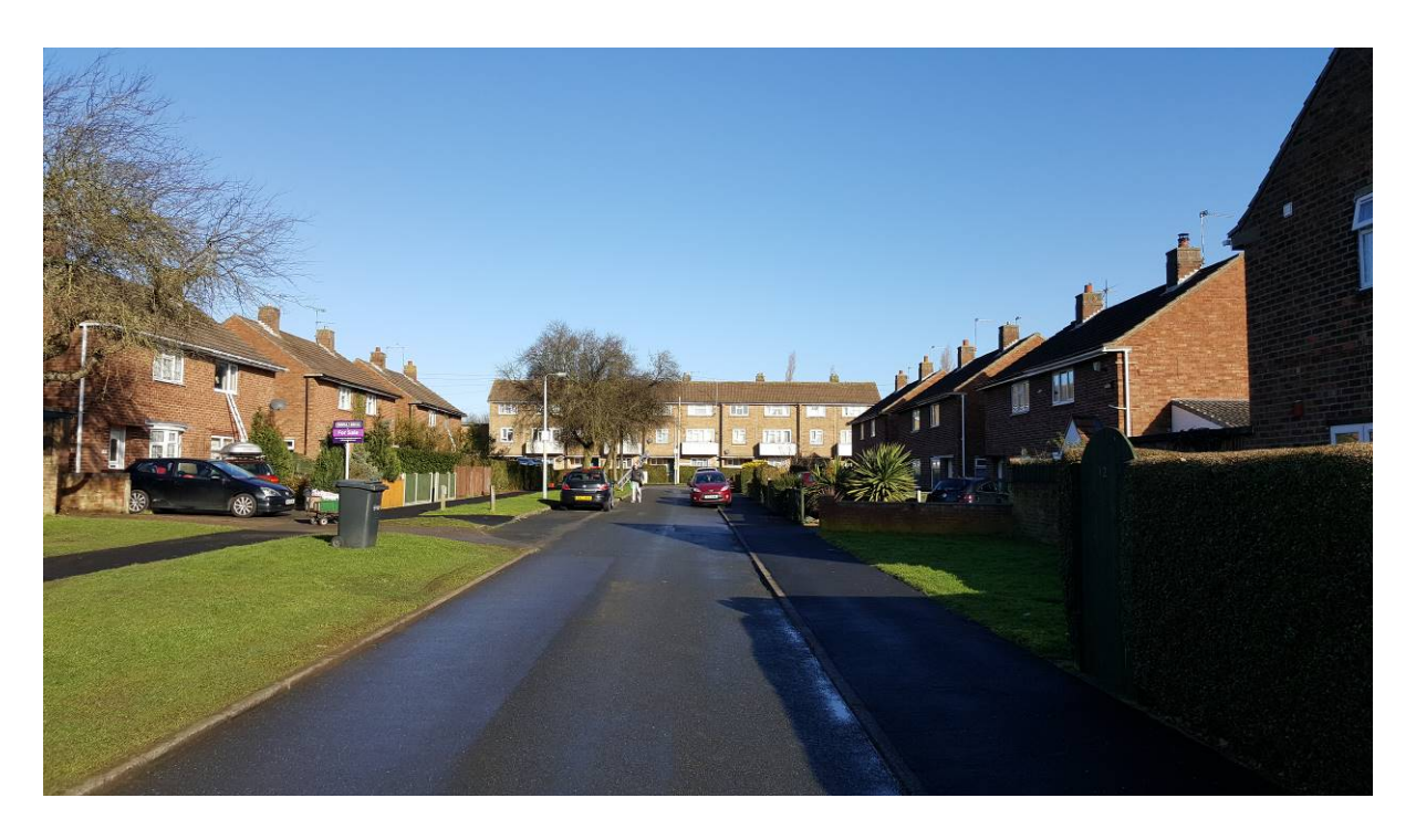
The view above is towards the end of Woodburn Close