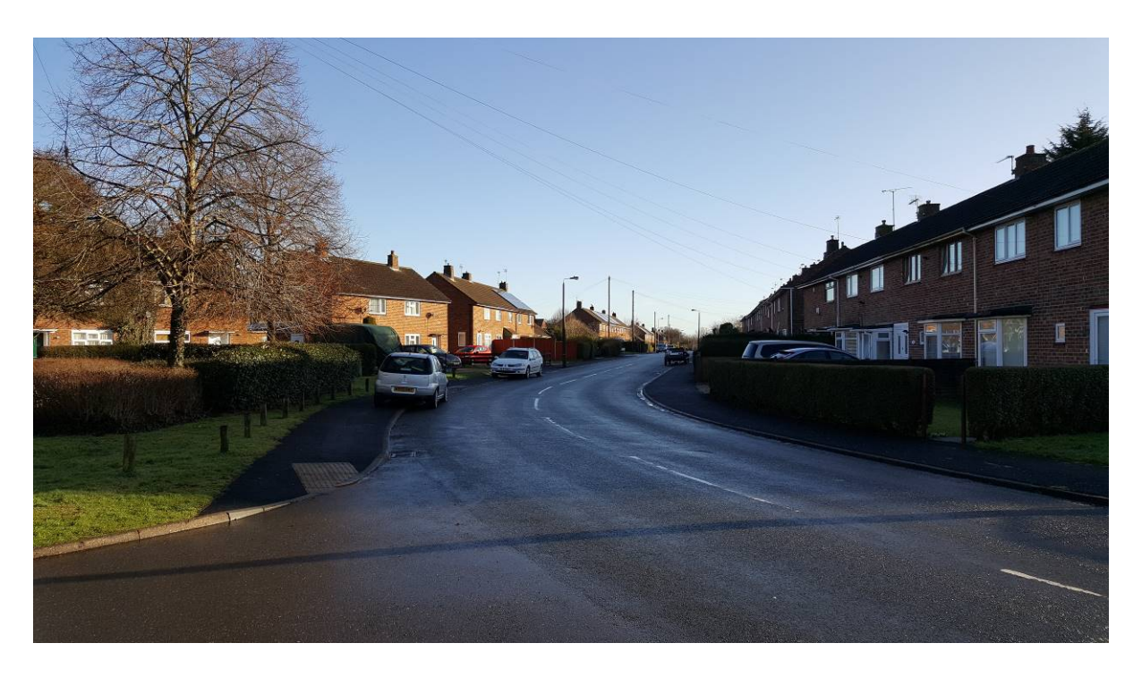
The views above and below are in either direction from the junction of Garfield Close with Queen Elizabeth Road