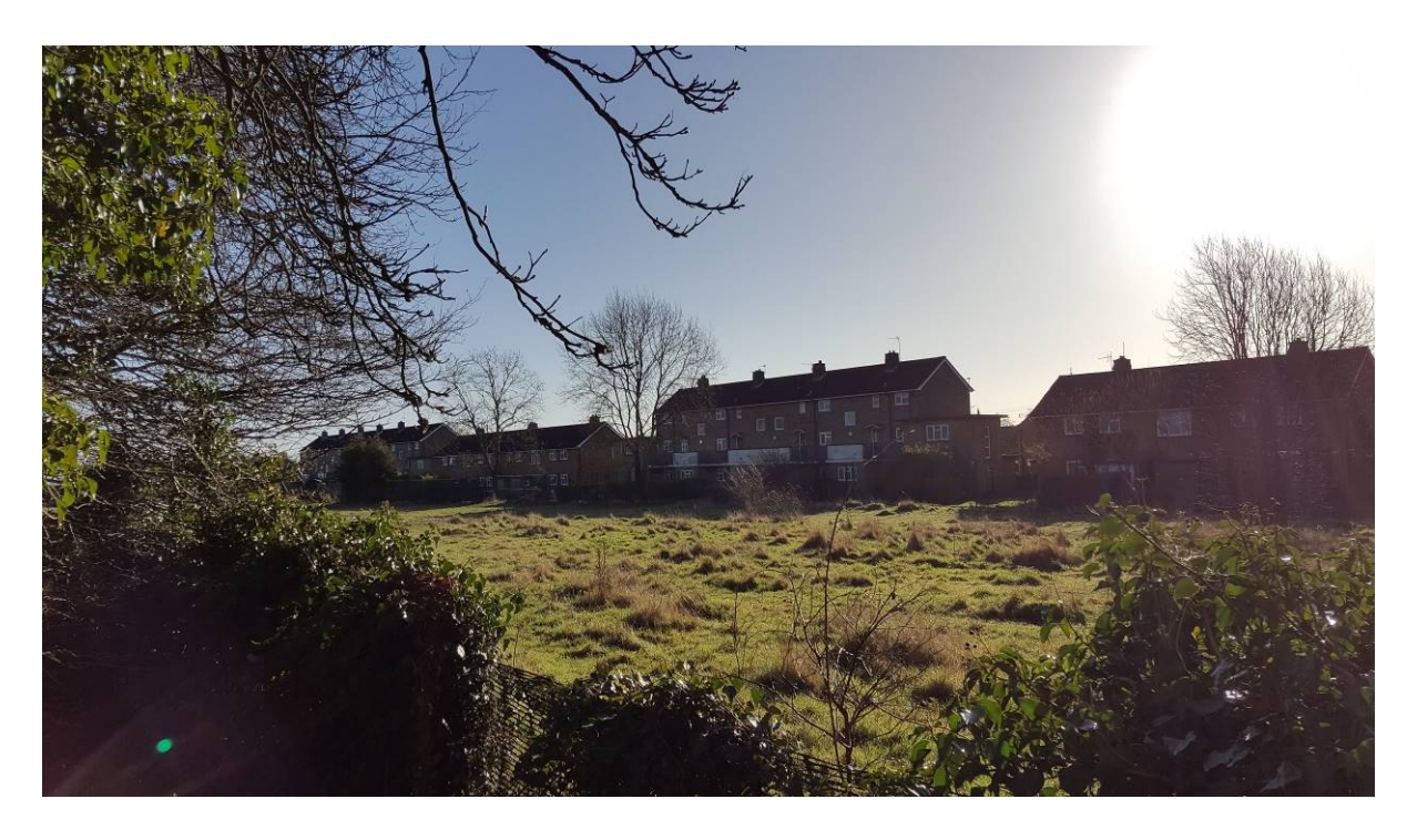
Above and below are views from the tree belt towards the three-storey buildings at the southern edge of the site