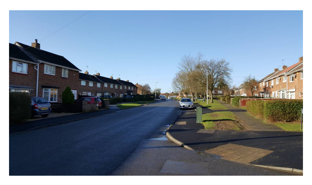
The views above and below are in either direction from the junction of Woodburn Close with Queen Elizabeth Road