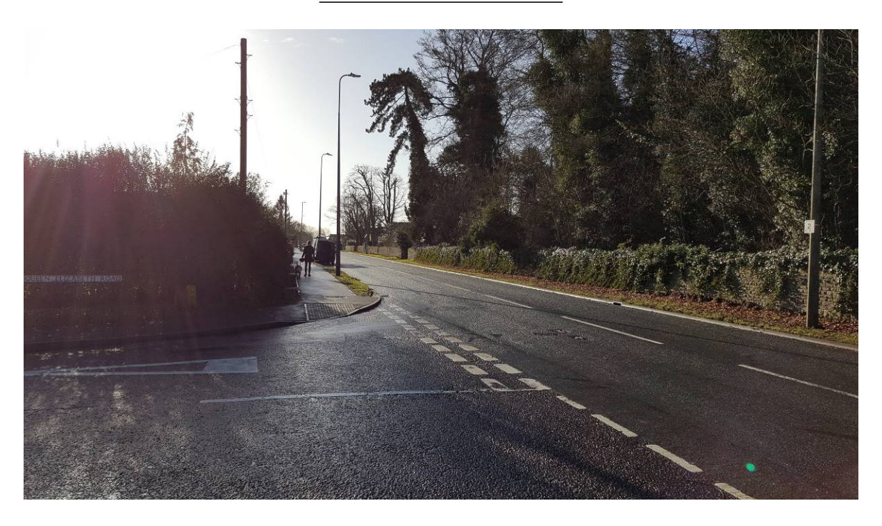
The views above and below are in either direction from the junction of Burton Road with Queen Elizabeth Road