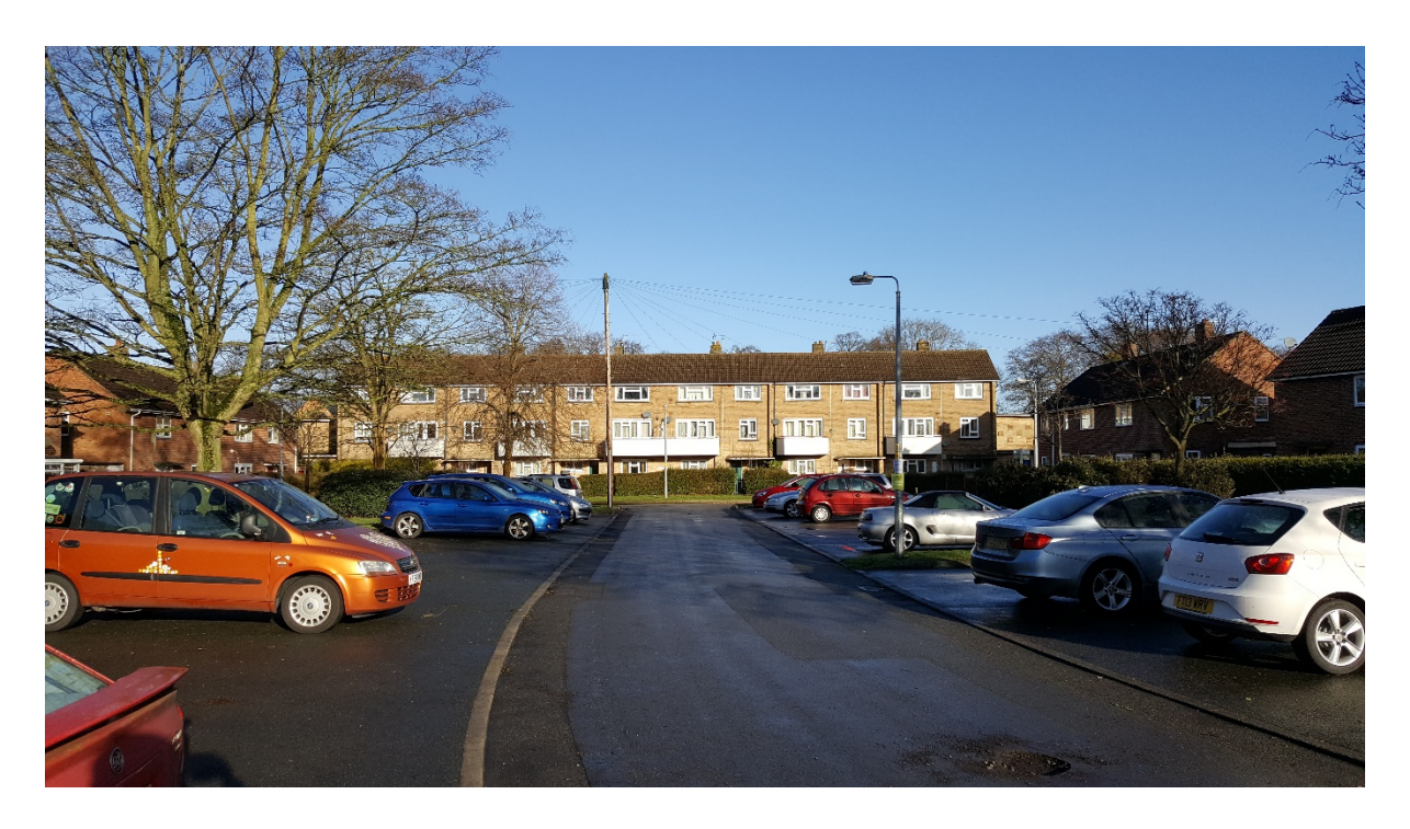
The views above and below are towards the end of Garfield Close