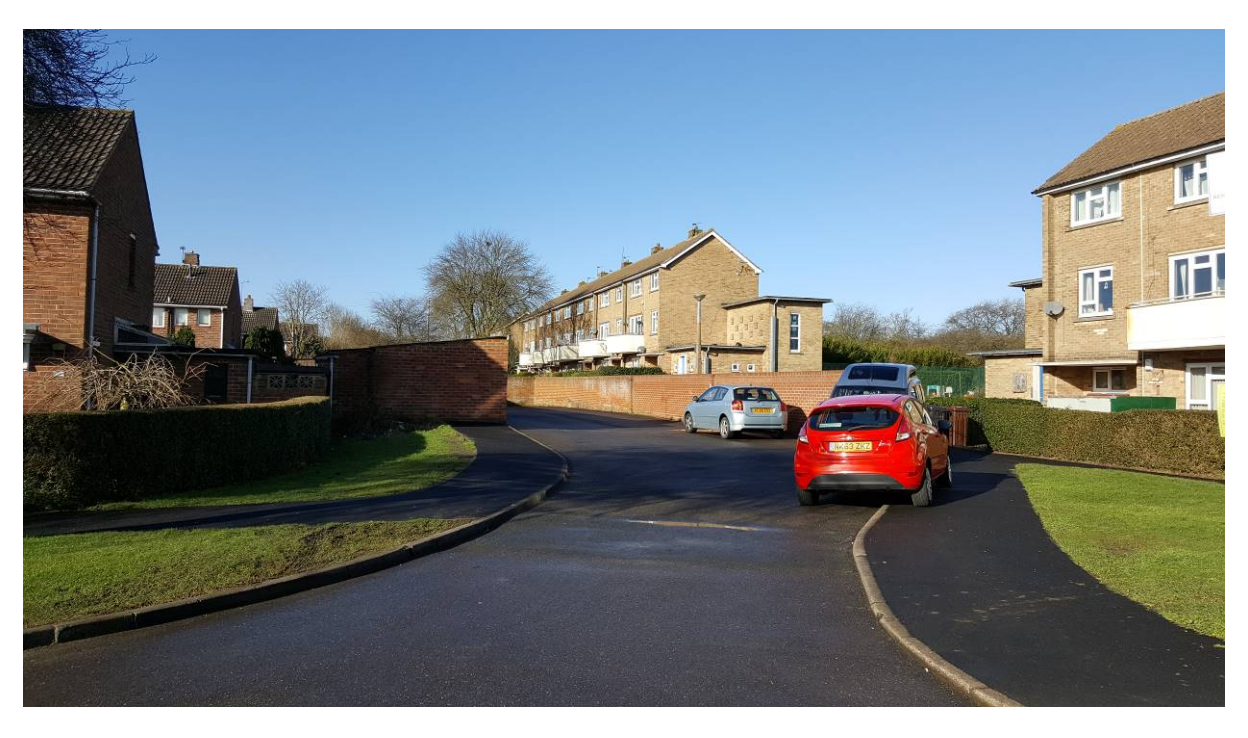
Above and below are typical views along the southern perimeter of the site